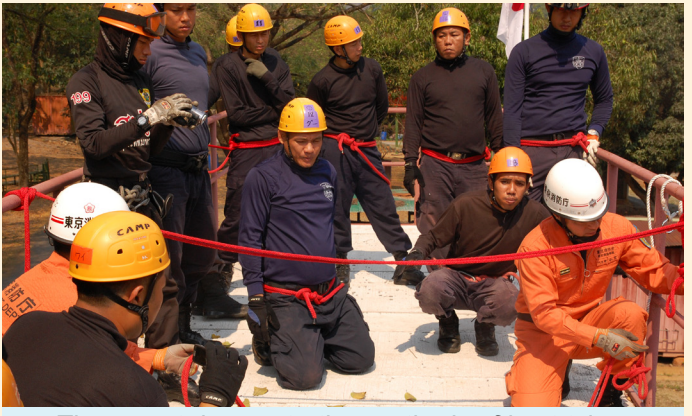
The expert demonstrating methods of knot-tying

Through the Specialist Dispatch Project, CLAIR Singapore aspires to strengthen the friendly ties and promote a higher level of knowledge transfer between local governments in Japan and the ASEAN region as well as India.