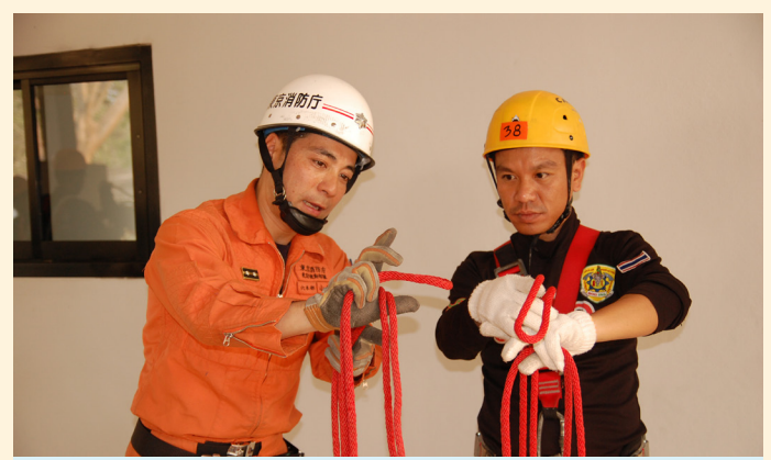
The expert (left) explaining methods of tying a figure 8 knot and double 8 knot

A total of 40 local firefighters handpicked from 8 fire stations (5 representatives from each station) under the purview of Bangkok Fire and Rescue Department