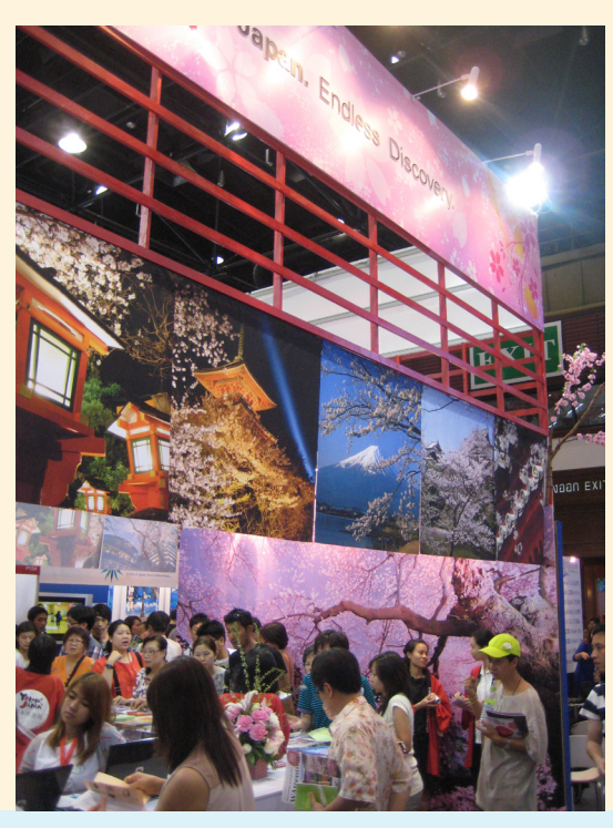
Sakura-decorated Japan Zone at TITF #12

Apart from the above-mentioned travel fairs, this year was also the first time that CLAIR Singapore had participated in the Cool Japan Festival held in Mumbai, India; as well as the ASTINDO Fair held in Jakarta, Indonesia. The amount of support and interest towards Japan as shown by local visitors at these events have been extremely positive and encouraging, and CLAIR Singapore hopes to be able to continue to attend and participate in these events to further help promote Japan-bound tourism through spreading the charms and attractions of Japan's local regions.