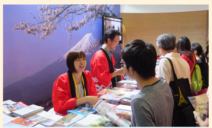
CLAIR Singapore staff attending to Japan booth visitors at MATTA FAIR Kuala Lumpur 2013