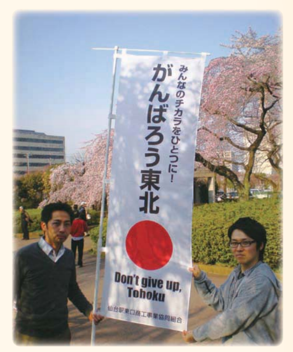
The banner reads "Gambaro Tohoku", which means "Let's move forward together Tohoku"

In the aftermath of the earthquake, several relief activities were carried out by our friends, including a donation drive organized by the JET Alumni Association (JETAA) Singapore, an association established by former JET Programme participants who had previously worked in Japanese schools and local governments. Initiating an effort named the "Message of Hope," the alumni also sent handmade cards with messages of encouragement to schools in the afflicted areas.