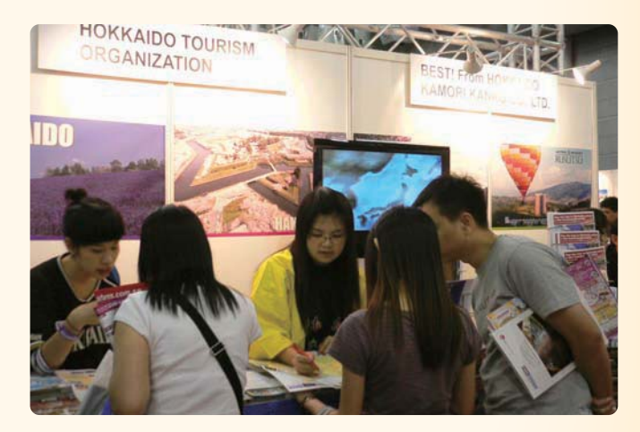
JET alumnus (third from left) providing travel information to visitors at the Hokkaido booth during NATAS Travel Fair 2011

CLAIR Singapore shares strong ties with JETAA Singapore. In this regard, JETAA Singapore recently held its annual general