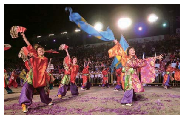
Nippon Domannaka Festival's lively performance at Chingay Parade 2011

Working to promote the Nippon Domannaka Festival into a similar major international festival as the Chingay Parade, the Japanese performers also took this opportunity to interact with other parade-participating groups from other countries such as Sri Lanka, Taiwan and Indonesia, and to extend an invitation to them to participate in future Nippon Domannaka Festivals in Japan.