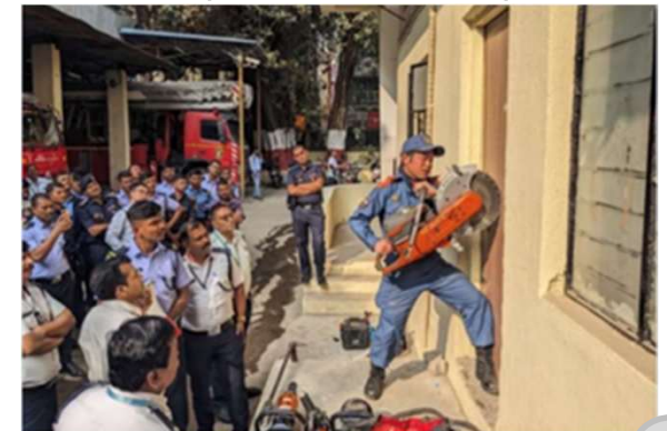
【On-site training on firefighting and disaster prevention】