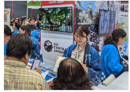
【Support for Toyama Prefecture's booth operation in Thailand (Toyama Prefecture)】