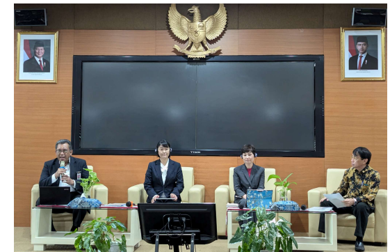
【Indonesia-Japan Knowledge Exchange Seminar in Indonesia】