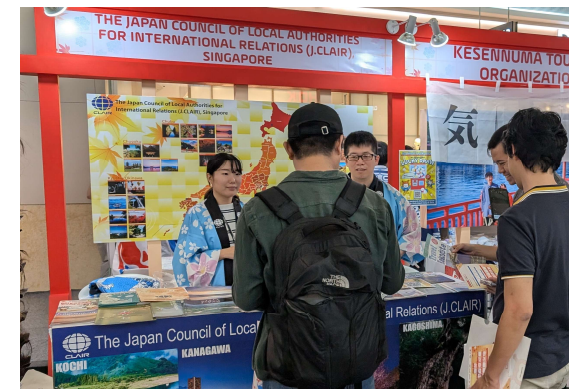
【Japan Travel Fair 2024 (Indonesia)】