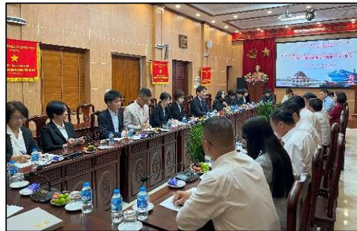
【Participants Receiving an Explanation from Hanoi City, Vietnam (Hanoi People's Committee)】