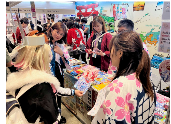
【AFASG 2024 (Singapore)】

In 2023, J.CLAIR Singapore cooperated with JNTO to set up a ‘Visit Japan’ promotional booth at Anime Festival Asia Singapore 2024 (AFASG24). The aim was to introduce various anime and manga themed initiatives and events organized by the local governments, as well as the real-life locations where these anime and manga were based. Visitors could learn more through PR pamphlets and promotional videos.