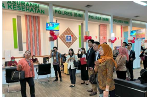
【Participants receiving a briefing about the operations of One Stop Services (Bekasi City Hall)】