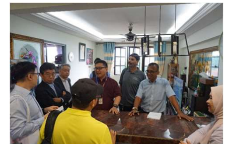
【Local training on public housing management】