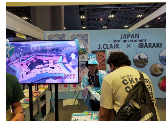
【AFASG 2023 (Singapore)】

In 2023, J.CLAIR Singapore set up a 'Visit Japan' promotional booth at Anime Festival Asia Singapore 2023 (AFASG23). The aim was to introduce various anime and manga themed initiatives and events organized by the local governments, as well as the real-life locations where these anime and manga were based. Visitors could learn more through PR pamphlets and promotional videos.