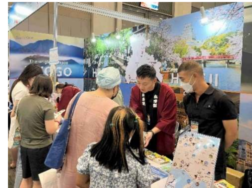
【Support for Hyogo Prefecture's booth operation in Thailand (Hyogo Prefecture)】