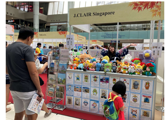
【Japan Travel Fair 2023 (Singapore)】