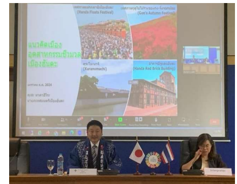
【DLA-CLAIR-MIC Joint Hybrid Seminar in Thailand】