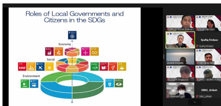
Lecture on public engagement (Mitaka City)

Officers from the various related departments in Kuala Lumpur City Hall, as well as representatives from the Malaysia Association of Local Authorities (MALA) participated in a series of online lectures. The lecture on public engagement showcased Mitaka City's initiative of 'Machikoe (Voices of Local Residents)', whereas the lecture on sports facilities management featured a case study on the Designated Manager System adopted by Fukuoka City's Higashi Hirao Park. On the