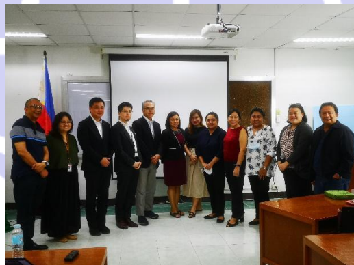
Group photo of J.CLAIR Singapore members and the UPLB representatives

In the occasion of the event, representatives of the UPLB expressed their interests for further cooperation in the future. Through various activities, J.CLAIR Singapore will continue to strive to build and strengthen networks with related organizations in ASEAN, India, and Sri Lanka, and will contribute to overseas activities of Japanese local governments.