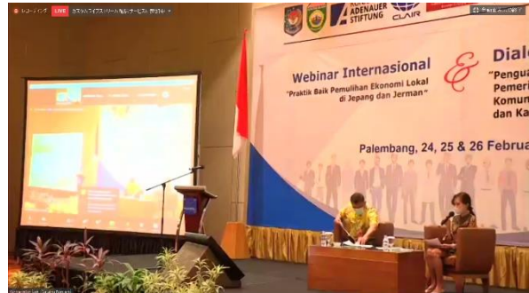
(Seminar Venue in Indonesia)

On 25th February 2021, an International Online Seminar was implemented by Indonesia's Ministry of Home Affairs (MoHA) in collaboration with J.CLAIR Singapore, where both parties have concluded an MOU in 2019.