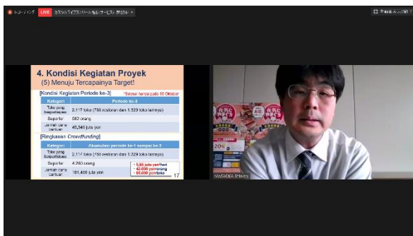
(Presentation of Yamaguchi Prefecture)

Around 500 participants who are mainly local government officials in Indonesia took part in the session and there was a lively exchange of ideas between the speakers and participants.