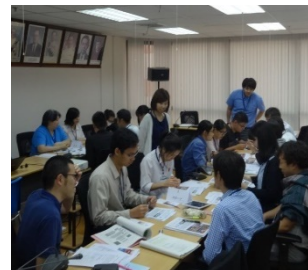
【Exchange session with students of Japanese Language in Thailand】