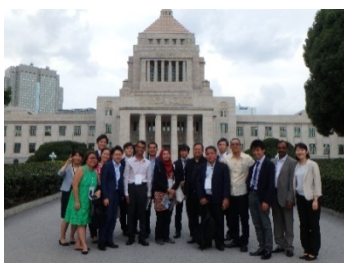
【Visit to the National Diet Building in Tokyo】