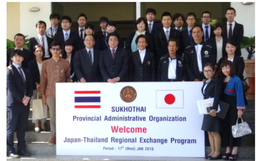
【Meeting with Sukhothai PAO in Thailand】