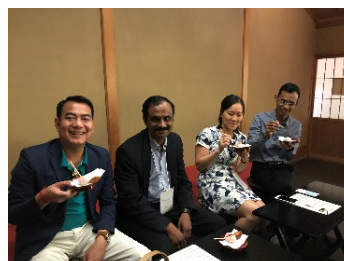
【Green tea tasting experience at Kokura Castle (Kitakyushu City)】