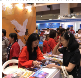
【J.CLAIR Singapore staff at travel fair】

J.CLAIR Singapore compiles reports on the events and disseminates the findings to Japanese local governments.