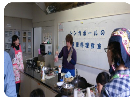
【A CIR conducting a cooking session to promote cross-cultural understanding】