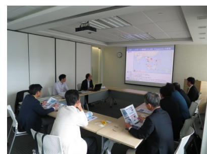
【Conducting briefings at J.CLAIR Singapore Office】