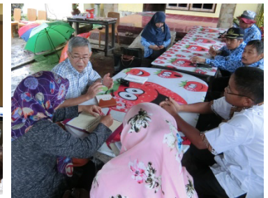
【A specialist giving guidance during a local site visit in Indonesia】