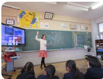
【An ALT teaching lessons to students in a local Japanese school】