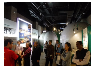
【Learning about the history of pollution at the Environment Museum (Kitakyushu City)】