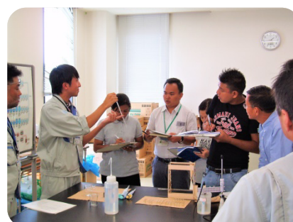
【Trainees from Myanmar learning about water quality inspection/Fukuoka-city】