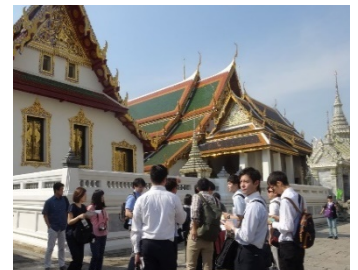
【Site visit in Bangkok】