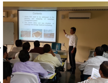
【A specialist conducting a lecture to the local participants in India】