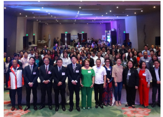
【Group photo of the speakers and participants in Philippines】