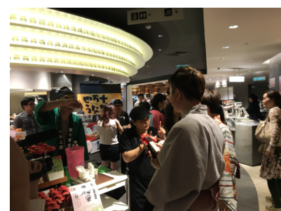
【Malaysian consumers trying specialties at the fair】

In order to support Japanese local food manufacturers exploring new overseas markets in Southeast Asia, CLAIR organizes the Japan Local Specialty Fair which aims to provide a test-marketing platform for local signature products sourced through local governments across Japan. The Fair was held in Bangkok for 4 consecutive years, and it was held in Kuala Lumpur in FY2017. The fairs garnered a lot of participation from suppliers from many local regions in Japan.