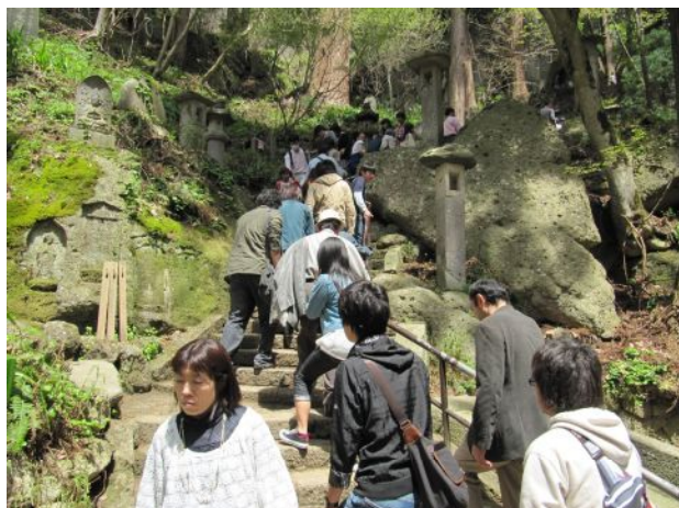
Many people come to Yamadera (山寺/山形市) on holidays.