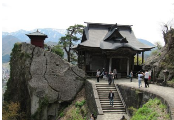
There is almost no damage in Yamadera.