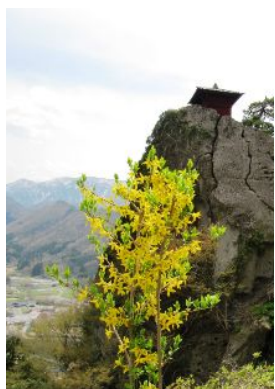
You can see colorful flowers in many places around Sendai!

The spring in Japan is characterized with a variety of beautiful flowers. Adding to cherry blossoms, you can see many kinds of colorful flowers everywhere.