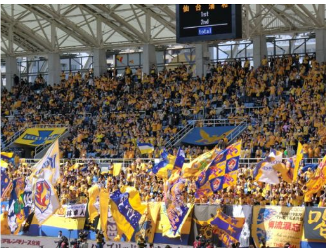
Their performances will make us not only excited but also cheerfull!-Yurtec Stadium Sendai (ユアテックスタジアム仙台)