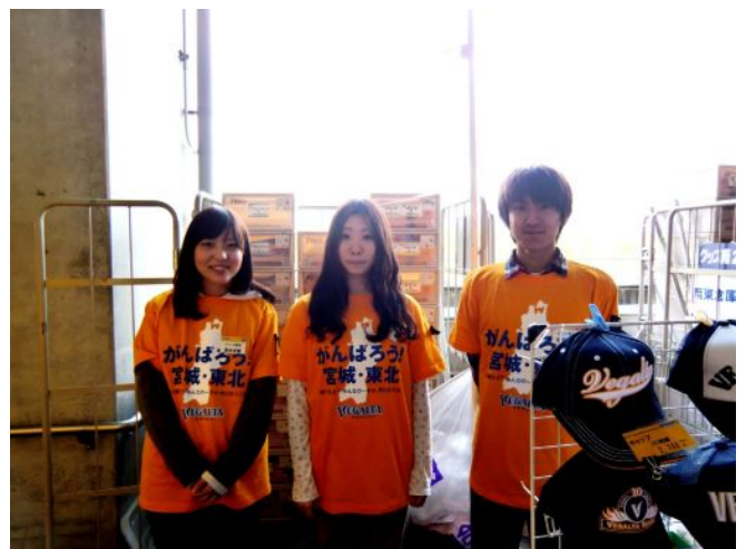
Some fans were wearing T-shirts written a message, "がんばろう！宮城・東北 (Go forward! Miyagi and Tohoku region!)"