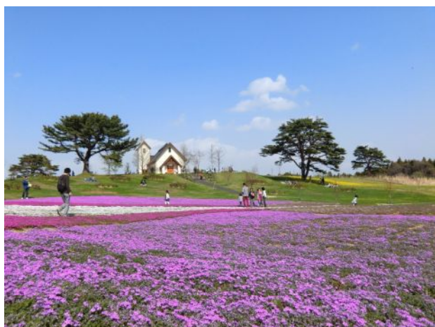
It looks like covering with a purple carpet!-Yakurai, Miyagi