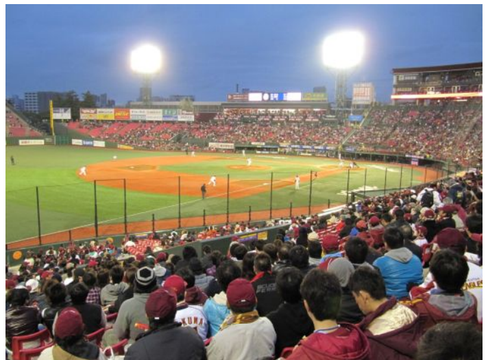
Despite a little cool weather, a lot of fans came to the ballpark to support Rakuten Golden Eagles-Kleenex Stadium Miyagi (Kスタ宮城)

Now, our teams have come back to Sendai! Because of the disaster in March, the two major professional sports in Japan, baseball and soccer, had been suspended their season. However, finally a new season has begun! Their exciting performance will cheer us up!