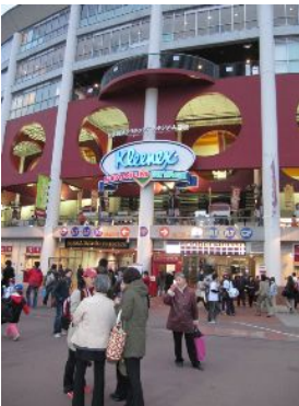
People in Sendai were heartily waiting for the opening of the new season.

Now, our teams have come back to Sendai! Because of the disaster in March, the two major professional sports in Japan, baseball and soccer, had been suspended their season. However, finally a new season has begun! Their exciting performance will cheer us up!