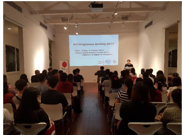
JET Programme Publicity Event at Japan Creative Center

In order to promote exchange between Singapore and Japan, JETAA Singapore holds Yukata workshops and Japanese cooking classes etc. to introduce Japanese culture. The association also provided booth support for Japanese municipalities at the travel fairs which are held every year in Singapore.