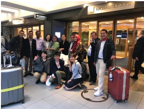
The writer (standing, 5th from left in green) pictured with the group of participants and members of staff

Mayor of Municipal Government of Dulag, Leyte, Republic of the Philippines~