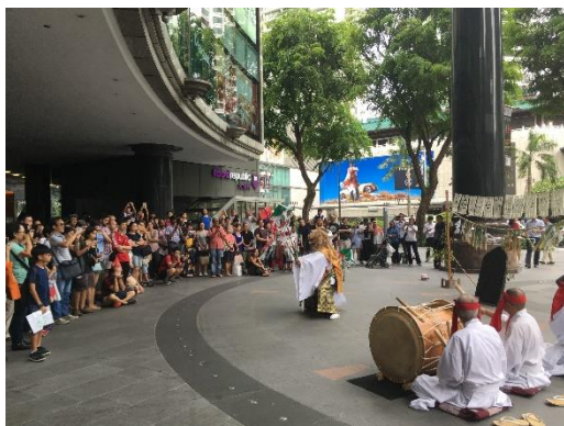
A Crowd of Spectators in Front of Isetan Scotts

On a final note, this event was carried out in cooperation with many organizations such as Miyazaki Prefecture, Takachiho Town, the Japan Foundation, the Japanese Cultural Society, Singapore, and the People's Association. J.CLAIR Singapore will actively cooperate with each related organization to further spread and promote Japanese traditional arts in the future.