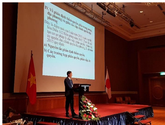
The Vietnamese Keynote Speech