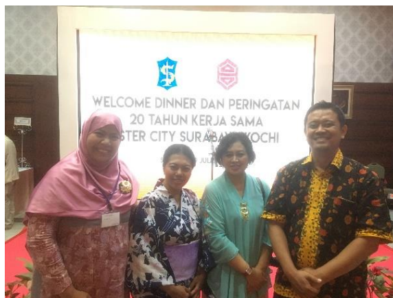
Former JET CIRs from Surabaya

3 former CIRs from Surabaya who were employed in Kochi City have long been actively involved in various programmes in the Surabaya Yosakoi Festival which is held every year in Surabaya. Thus, the foundation for JETAA’s activities in Indonesia is already set and the official establishment of the chapter is expected to further enhance members’ activities.