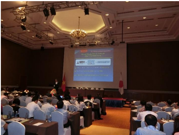
Case Study Presentation by Fukuoka City

management of bigger cities such as Fukuoka City, many were keen to learn more about its budget and human resources management, putting forward questions such as, “Is the city allowed to raise the salaries of its staff in an event of a budget surplus?”, or “Do local governments in Japan have the authority to reduce their staff strength by themselves?”