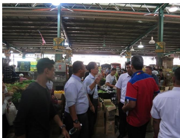
Site Visit at Pasar Borong Kuala Lumpur

temperatures, sanitation and quality of products. In addition, topics including the streamlining of shipment logistics, maintaining low temperatures at storage facilities as well as the standard operating procedures using Hazard Analysis and Critical Control Point (HACCP) were also explained. A case study on the "Kyoto Vegetable Festival", which is conducted to revitalize the local markets in Kyoto was also featured as a reference for the local participants.