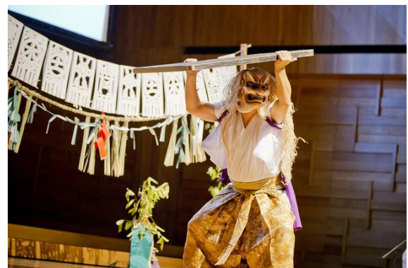
The Performance that Fascinated the Audience