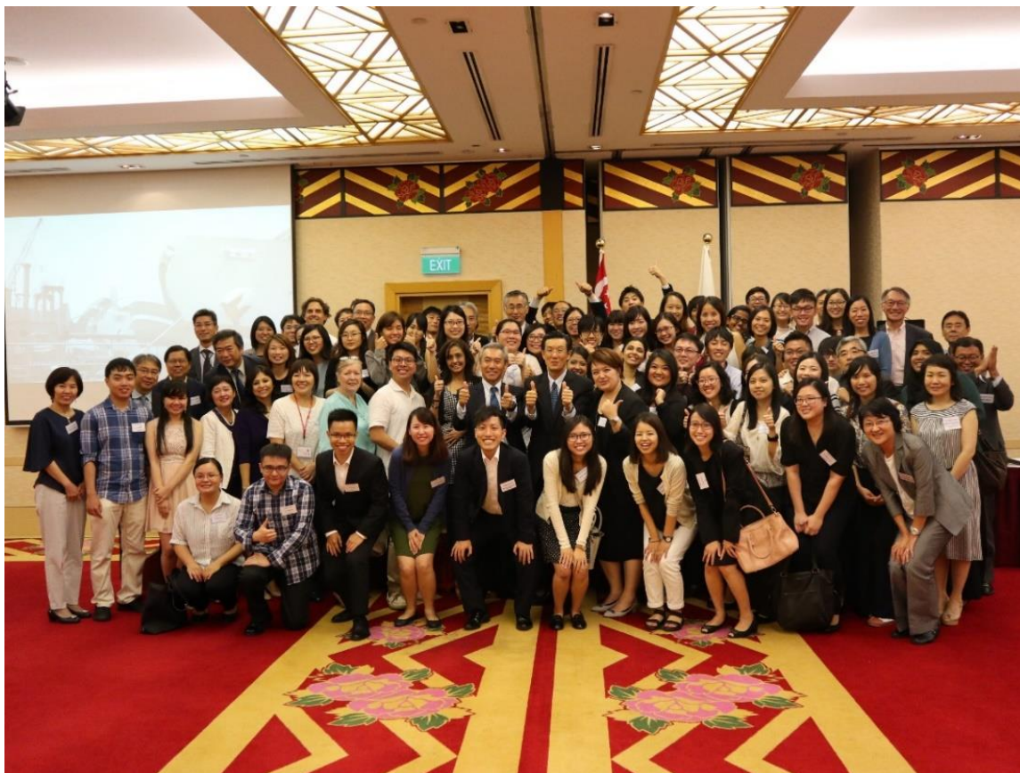
JET Super Fair ~A WelcomeBack Party in Singapore~