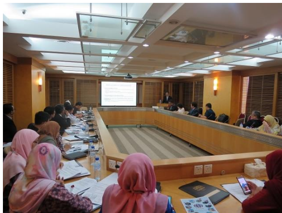
A Scene from the Lecture

From 2 to 5 October 2017, J.CLAIR Singapore implemented the Specialist Dispatch Project in collaboration with Kuala Lumpur City Hall. Under the Specialist Dispatch Project, Japanese local government employees with professional knowledge or technical skills are dispatched to local governments in the ASEAN region and India so as to leverage the quality of administration as well as capacity building in those areas, in addition to strengthening the cooperative ties between Japanese and overseas local governments.