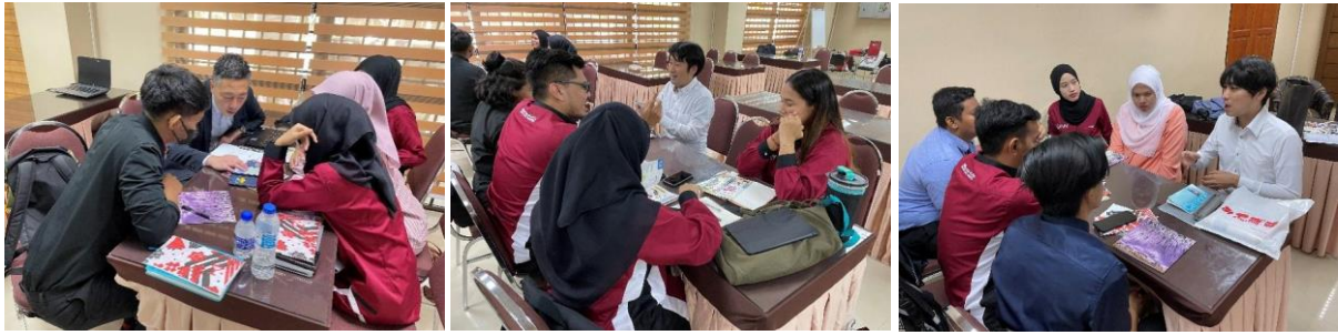
Presenters joined groups of UUM students