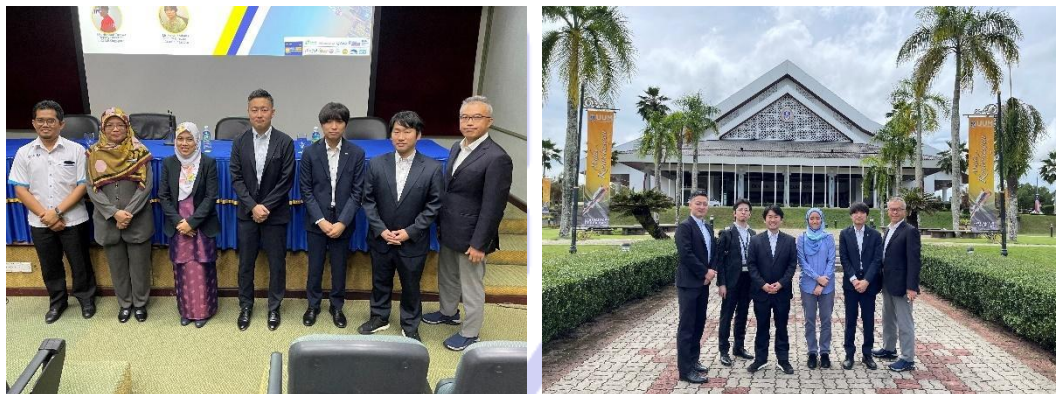
Group photo of J.CLAIR Singapore staff members and UUM representatives

Through various initiatives, J.CLAIR Singapore will continue to strive to build and strengthen networks with related organizations in ASEAN, India, and Sri Lanka, and will contribute to the overseas activities of Japanese local governments.