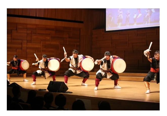
Energetic drumming in the creative Eisa dance at SOTA