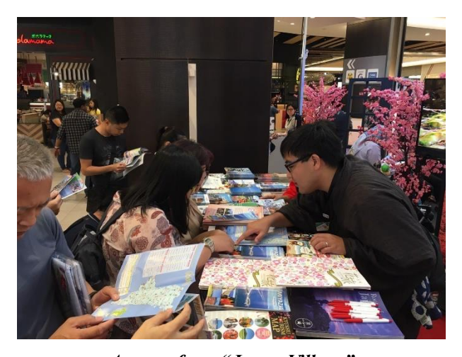
A scene from "Japan Village"

It is hoped that Japan Village has served as a catalyst in attracting more Indonesians to visit Japan in the future.