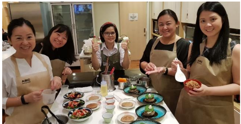
Participants of the cooking class