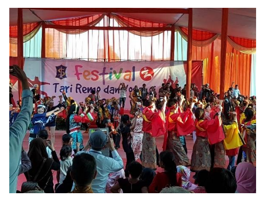
Surabaya-Yosakoi Matsuri in 2017

Today, the number of JET Programme participants from Indonesia has reached 16 people (11 returnees and 5 still in duty). Along with the increasing number of participants, there arised the need for an alumni organisation. Such organisation has been set up in several other countries following the JETAA-International. We, JET alumni of Indonesia, are really passionate about incepting this organisation, and with the strong support from CLAIR, finally this organisation was established this year. JETAA-Indonesia provides a platform where the alumni of JET Programme from Indonesia could meet up, share information, support each other and help to strengthen the international relations between Japan and Indonesia.