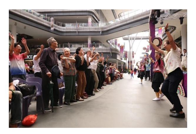
The audience stood up and danced with the Eisa performers

This performance would not have been possible without the cooperation of many organisations such as Okinawa Prefecture, The Japan Foundation, JCS Singapore and the People's Association Singapore. The creative Eisa performance is the third consecutive successful attempt by J.CLAIR Singapore to introduce Japanese traditional performing arts to overseas audiences, following a geisha performance in 2016 and a 'Yokagura' folk dance in 2017. We will continue to work with our counterparts to promote Japanese traditional arts of the various local regions, thereby fostering mutual understanding and cultural exchange.