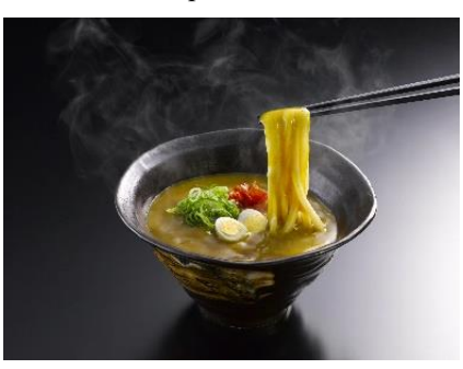
Toyohashi Curry Udon

This time, we will introduce Toyohashi Curry Udon which is a unique dish invented in this city. Udon is a