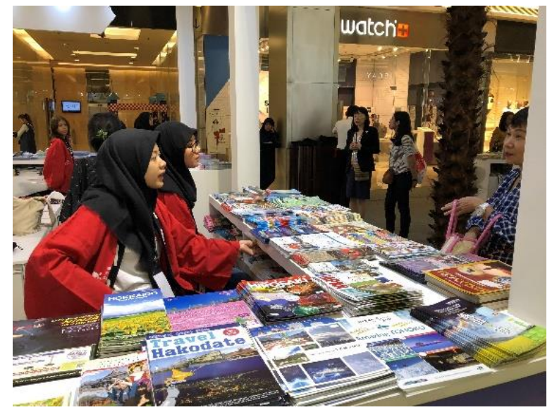
Japan Travel Fair 2018

The number of Indonesian travellers to Japan reached 350,000 in 2017, which is the highest record to date. This number can be expected to continue to grow in the future with a remaining focus on Japan's "Golden Route", due to the potential of the Indonesian market that boasts a population of about 260 million in total. The key to success for the future would probably lie in how Japan manages to convey its charms and attractions to Indonesia's Muslim community, which makes up 90% of the country's population.