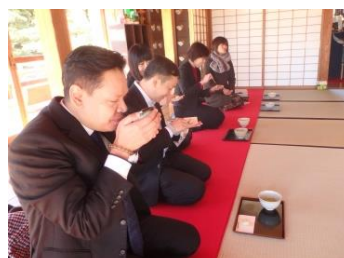
【 Tea Ceremony experience in Tokyo】