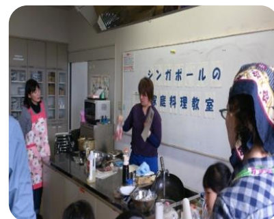
【A CIR conducting a cooking session to promote cross-cultural understanding】