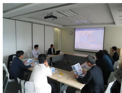
【Conducting briefings at J.CLAIR Singapore Office】