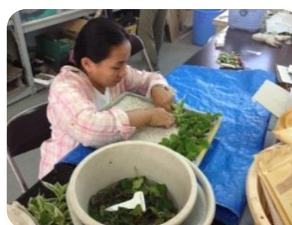
【A trainee from the Philippines learning about plant cutting and breeding】