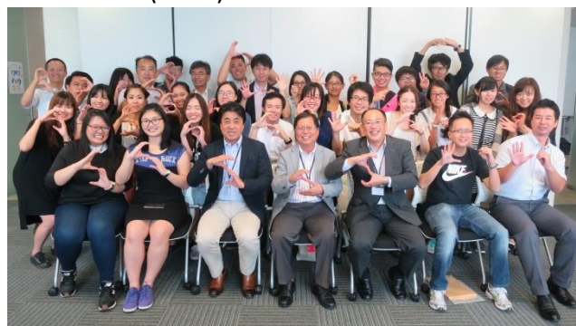
【Cultural exchange with students learning Japanese in Singapore】