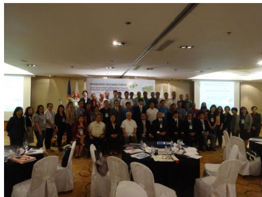
【Group photo of the speakers and participants in Philippines】