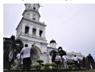
【Exchanging views at Kuala Lumpur City Hall and visiting sites in Johor Bahru】