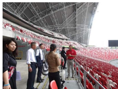
【Attending to Japanese local government officials at Singapore Expo on their visit】