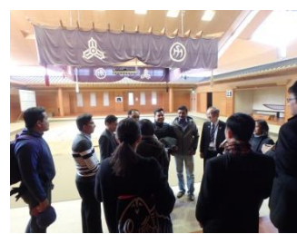
【Visit to Budokan (martial arts hall) in Miyazaki】