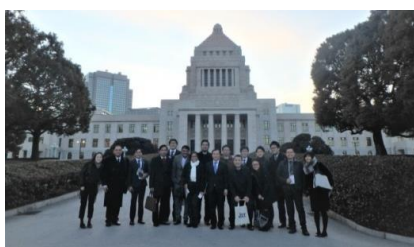
【Visit to the National Diet Building in Tokyo】