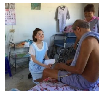
【A specialist giving guidance during a local site visit in Thailand】