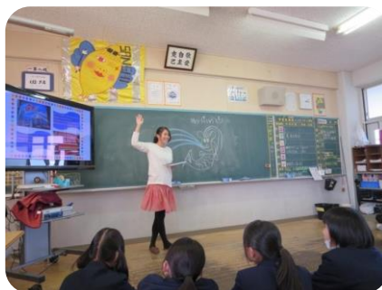
【An ALT teaching lessons to students in a local Japanese school】