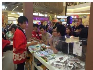
【J.CLAIR Singapore staff at travel fair】

J.CLAIR Singapore compiles reports on the events and disseminates the findings to Japanese local governments.