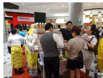
【Thai consumers trying specialties at the fair】

In order to support Japanese local food manufacturers exploring new overseas markets in Southeast Asia, CLAIR organizes the Japan Local Specialty Fair which aims to provide a test-marketing platform for local signature products sourced through local governments across Japan. The Fair was held in Singapore (2014) and for 4 years consecutively in Bangkok (2013 – 2016), and garnered a lot of participation from suppliers from many local regions in Japan.