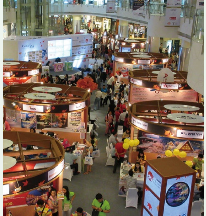
Overview of the Japan Travel Fair in Jakarta

There has been a continuous upward trend in Indonesian visitors travelling to Japan since the relaxation of visa regulations for Indonesian visitors in December 2014. It is hoped that the increase in visitors will contribute to future economic growth in Japan’s local regions as well as promote people-to-people exchanges between Japan and Indonesia.