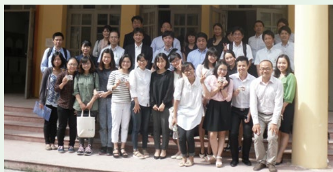
Group photo of all students and participants of the cultural exchange program