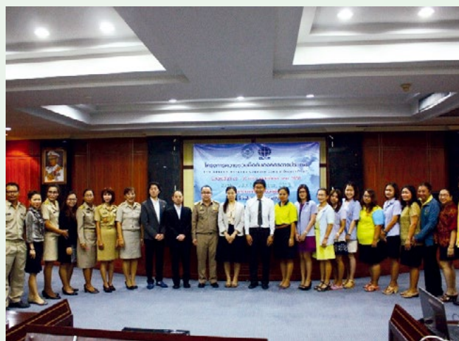
Group photo of the expert and local participants