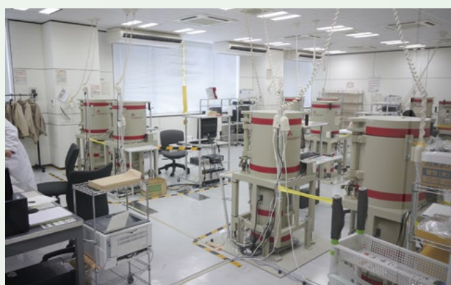
Germanium Semiconductor Detector