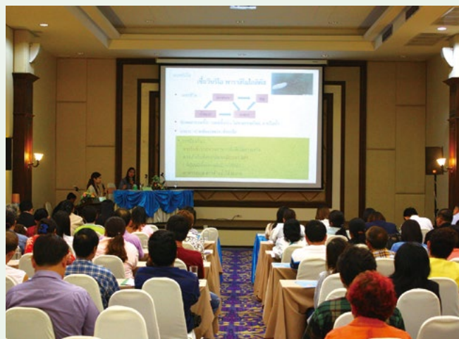
Lecture conducted by the expert

Through the Specialist Dispatch Project, CLAIR aspires to further strengthen knowledge transfer between local governments in Japan and the ASEAN region as well as India. Kindly contact CLAIR Singapore for further information on the project.