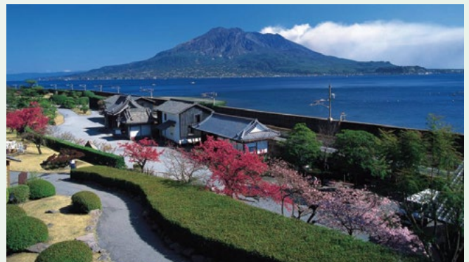
Sakurajima, one of the world's greatest active volcanoes and the symbol of Kagoshima

surrounded by the beautiful sea and inhabited with numerous rare species of animals and plants.