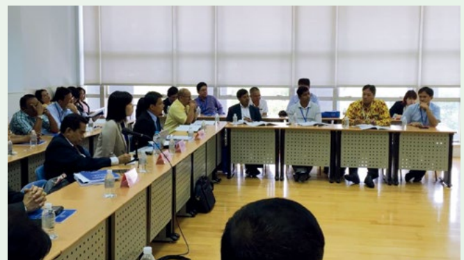
A simultaneous workshop session

Held annually, the EROPA meetings will be conducted in Manila, Philippines for year 2016 and in Seoul, South Korea for year 2017.