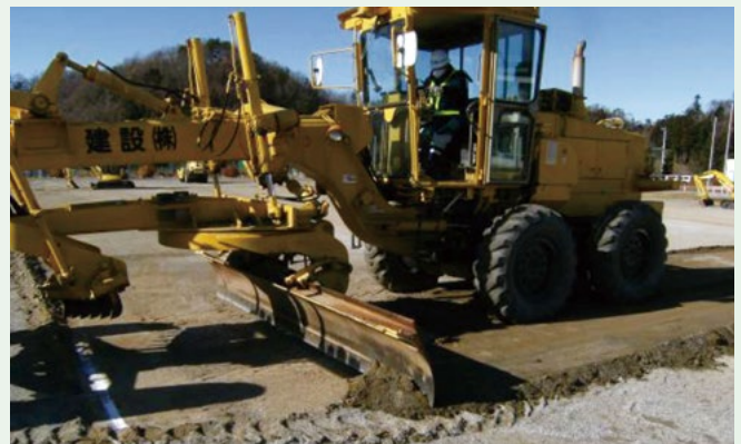
Decontamination of school yard (removal of surface soil)