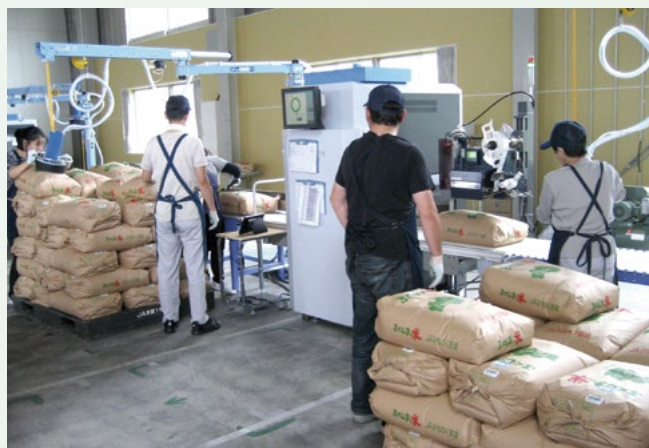
All bags of rice are tested

“Fukushima Shinhatsubai (Toward a new future of Fukushima)” ( http://www.new-fukushima.jp/monitoring/en/ ) is a website where visitors can search for the past results of the monitoring tests on agricultural and marine products. You can search by item or by area from a map. Results of tests on rice or horticultural crops are available at the website of “Fukushima-no Megumi Anzen Taisaku Kyogikai (Fukushima Food Safety Council).” ( https://fukumegu.org/ ) For any further enquiries or information about this matter, please contact the International Affairs Division of Fukushima Prefecture at ( http://www.pref.fukushima.lg.jp/site/voice/ )