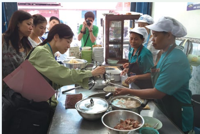
The expert conducting sanitary inspection at a local restaurant

Food safety and sanitation is one of the key focus areas of local governments in the ASEAN region in ensuring the general wellbeing of their local residents. Known to many as a food paradise with its heavenly street foods and vibrant night markets, Thailand and its local governments have been making a concerted effort through the years in ensuring the highest level of food safety locally. Realizing the importance of food safety and sanitation, Sisaket Municipality, a town located in the northeastern part of Thailand participated in CLAIR's Specialist Dispatch Project for fiscal year 2015.