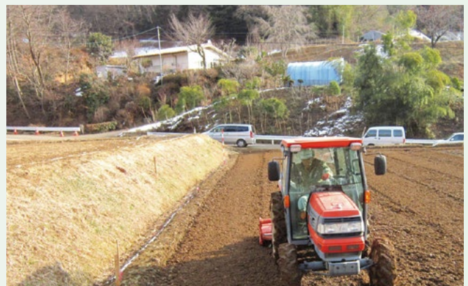
Decontamination of farmland (deep tillage)

Decontamination work is ongoing in the prefecture to remove radioactive materials released from the nuclear power plant incidents. The national government, prefecture, and municipalities are working together to decontaminate the living areas, including schools, roads, and farmlands.