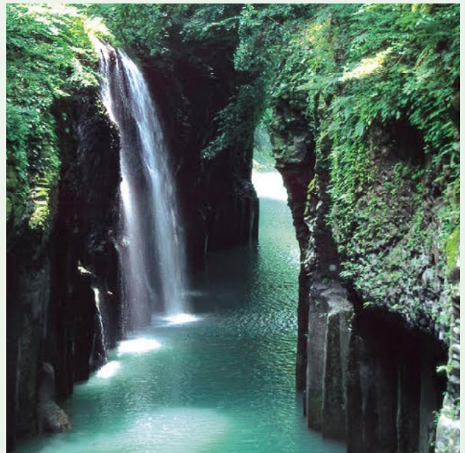
One can enjoy the beautiful scenery and magnificent view of Manai Waterfall on a boat through the Takachiho Gorge

From the Aya Teruha Suspension Bridge where one can overlook Japan’s largest evergreen forest, to the 100m tall high cliffs of volcanic basalt columns at Takachiho Gorge that was formed over time from the erosion of lava from Mount Aso; there are also many tourist spots and attractions at Miyazaki where one can experience the seasonal changes of nature.