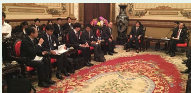
Opinion-exchange session at Ho Chi Minh City People's Committee