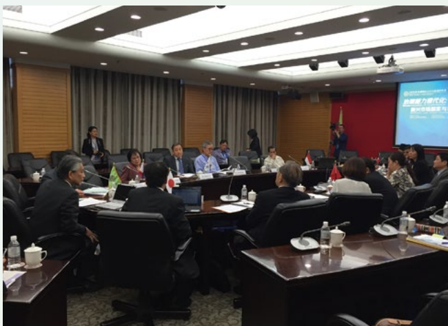
The 61st Executive Council Meeting of EROPA

The EROPA Conference officially started on 18 October, with the opening ceremony as well as the 25th General Assembly. Based on the main conference theme of "Modernization of Governance: Reforms and Good Practices in Emerging Markets", a series of forums and workshop sessions was conducted from 18 to 20 October, witnessing 100 professional academic papers being presented at the conference venue of Shanghai Administration Institute.