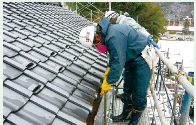
Decontamination of residential houses (removal of deposited materials)