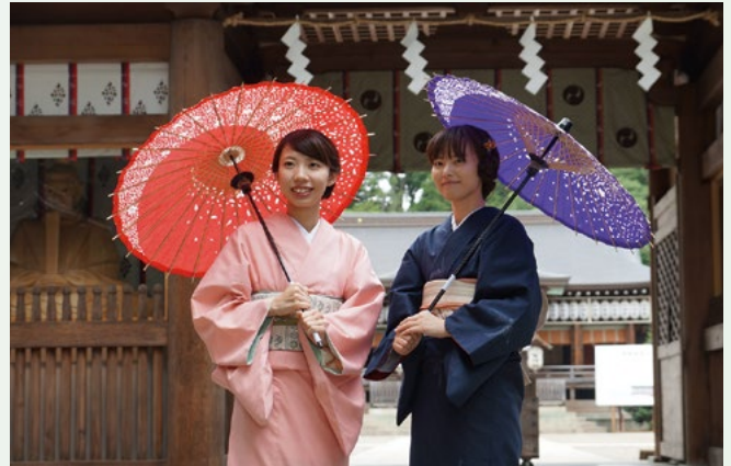
Traditional wear made from a unique silk-weaving technique, yuki-tsumugi, which is found in Oyama City

Easily accessible by the Shinkansen (bullet train), Oyama City is a great choice for a short getaway from the busy urban city life, where you may engage in activities such as fruit-picking, touring of sake breweries and factories, participating in seasonal festivals, or learning about Japanese traditions and cultures that have been passed down since ancient times. In addition, Oyama City also offers safe and delicious foods and produce throughout the year, such as wagyu beef, seasonal fruits and Japanese sake etc. Please visit Oyama City when you have time!