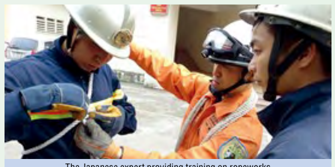
The Japanese expert providing training on ropeworks

CLAIR will continue to promote knowledge transfer between local governments in Japan and the ASEAN region as well as India through its Specialist Dispatch Project.