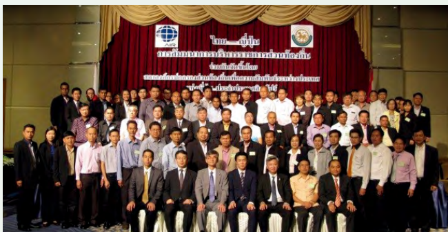
Group photo of the speakers and participants

Through such opportunities to share experience on local