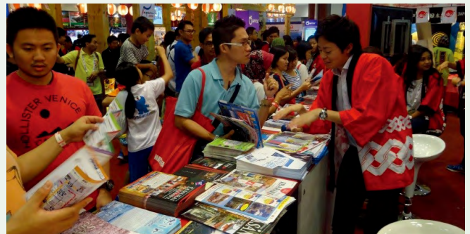
CLAIR staff answering enquiries of visitors at MATTA Fair

However, much can still be done in markets such as India, where Japan is less recognized as a tourist destination and many locals still have common misconceptions about the country being "expensive", or where "English is not spoken" and there is "a lack of suitable food choices" etc. With more and more Japanese local governments expanding their tourism promotion efforts within Asia in recent years and going forward, it is important that the quality and extent of information on Japan provided at these travel fairs should continue to improve and foreign visitors will get acquainted with the individual traits and features that each Japanese local area possesses and can offer.