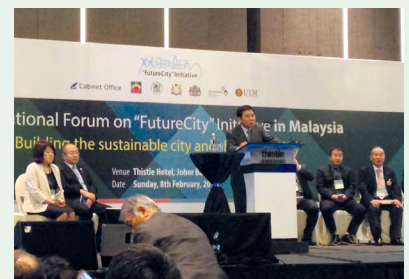
Mayor of Toyama City, Mr. Mori, explaining Toyama City's approach in implementing the Future City Initiative

CLAIR Singapore looks forward to proactively participate in such forums in the future, so as to play its part in enhancing knowledge sharing between Japan and the local regions.