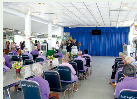
Visit to an elder care facility managed by the Nakhon Pathom Provincial Administration Organization

administration, CLAIR Singapore hopes to continue to contribute toward the promotion of local level cooperation between Japan and Thailand as well as between local governments in Thailand.