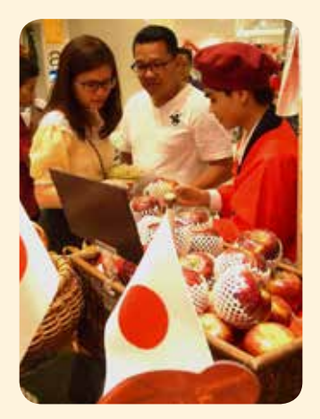
Promoting Japanese apples to Thai consumers

In an effort to support Japanese local governments that are eager to look for opportunities to market their local food products overseas, CLAIR has been organizing a food fair entitled "Japan Local Specialty Fair" which features famous local food products sourced through local governments from across Japan. The fair was held in Shanghai in FY 2010 and in Hong Kong in FY 2011 and 2012, all of which were extremely well-received by the consumers, hosting department stores and the participating food companies. In FY 2013, CLAIR held the Japan Local Specialty Fair for the first time in Siam Paragon department store in Bangkok, Thailand, which is emerging to be an important market in Southeast Asia for Japanese food products.