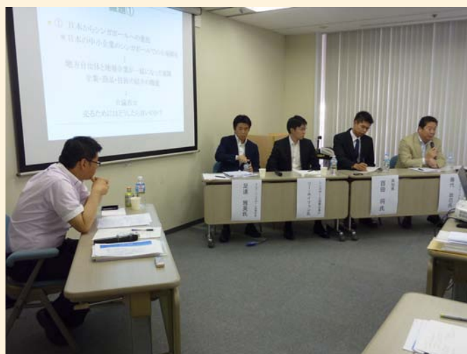
During the panel discussion

Several Japanese local government participants indicated that they would like to learn about more actual examples of overseas collaboration between Japanese and Singaporean companies, and the overall response that we have received on our seminar has been very positive. We would like to take this opportunity to express our appreciation to all our invited presenters and speakers, as well as participants for taking time to join us at the seminar. CLAIR Singapore will continue exploring initiatives to assist and support Japanese local governments in revitalizing their local economic activities, as well as sharing current trends and latest information on the ASEAN and Indian markets with our stakeholders in Japan.