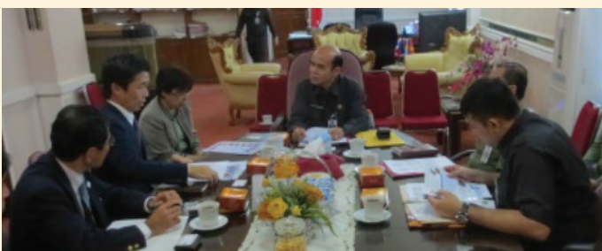
Opinion-exchange session held at Indonesia's Ministry of Home Affairs

Going forward, CLAIR Singapore hopes to continue enhancing our cooperative ties with Indonesia's Ministry of Home Affairs and looks forward to carrying out further collaborations that will be beneficial and valuable to both sides.