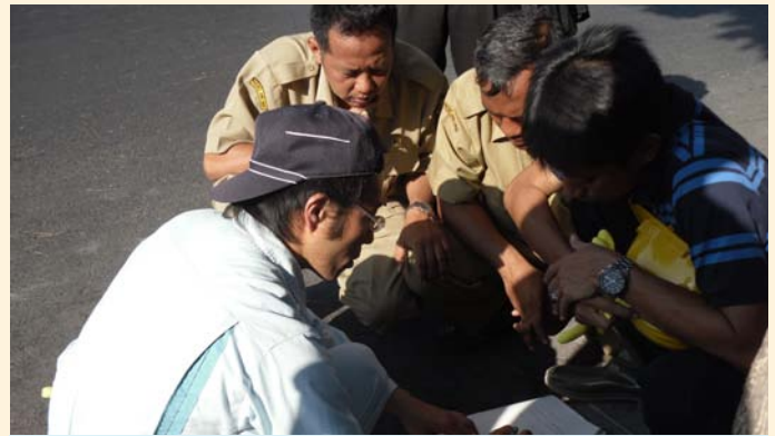
A scene from the local site visit

Mr. Koki Senba, a specialist in drainage management from the Naka Land Development Office of Japan’s Fukuoka Prefectural Government was dispatched to Surabaya from 20 ~ 25 October 2013 so as to provide the necessary training to the employees of Surabaya City Government. The training focused on the latest technologies and machinery that could be incorporated to effectively clear and prevent blockages caused by