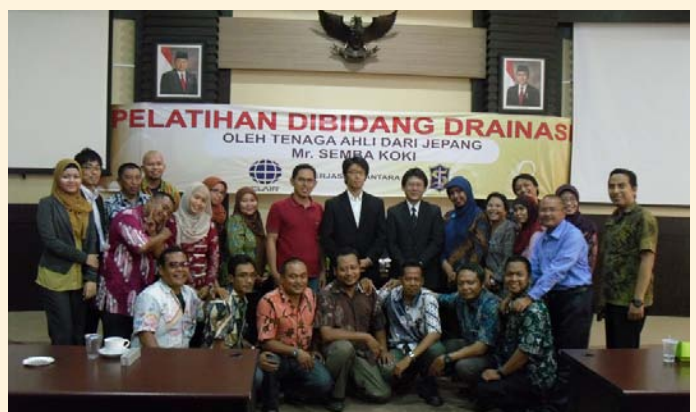
A group photo with participants

Through the Specialist Dispatch Project, CLAIR aspires to promote a higher level of knowledge transfer between local governments in Japan and the ASEAN region as well as India. Kindly contact CLAIR Singapore for further information on the project.