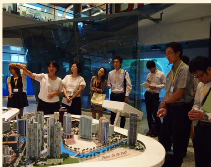
Participants listen to a briefing at the incinerator

It is widely known that despite space constraints, high population density and continued economic growth, Singapore has been able to maintain a beautiful, clean city with lush greenery and very little waste and garbage left strewn in public. Even its problem of scarcity of water has become a motivation for coming up with innovative water technologies that could instead provide business opportunities for the city-state.