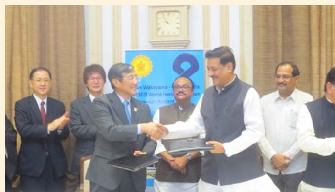
Mr. Yoshinobu Nisaka, Governor of Wakayama Prefecture (front row, left) and Mr. Prithviraj Chavan, Chief Minister of Maharashtra State Government (front row, right) shaking hands during the MOU signing ceremony

The promotion of international relation with local governments worldwide has been a key area of focus for Japan's Wakayama Prefecture in recent years, and this endeavor is further strengthened by the signing of a Memorandum of Understanding (MOU) between the prefecture and the State Government of Maharashtra in India. On 9 October 2013, a MOU to enhance cooperation in the fields of tourism promotion and agro-food processing technology was concluded between Wakayama Prefecture and Maharashtra State Government. The MOU is expected to promote tourism receipts and catalyze investment activities across the 2 states.