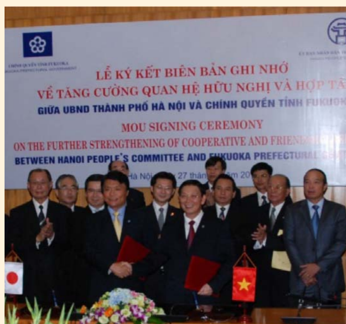
MOU Signing Ceremony between Hanoi People's Committee and Fukuoka Prefectural Government.

In conjunction with the anniversary, various commemorative events promoting Fukuoka prefecture as well as celebratory receptions hosted by the Hanoi People's Committee and the Embassy of Japan in Vietnam were held. CLAIR Singapore had supported and provided logistics support where necessary to facilitate the successful completion of the commemorative events.