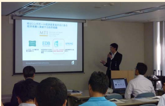
Presentation by IE Singapore