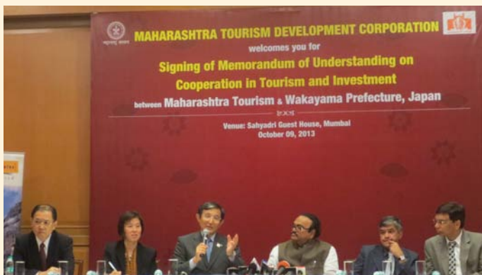
Governor of Wakayama Prefecture (third from left) attending to media enquiries

CLAIR Singapore provided the necessary support to Wakayama Prefecture related to the conclusion of the MOU, and we aspire to assist in the establishment of more friendly ties between Japanese and foreign local governments.