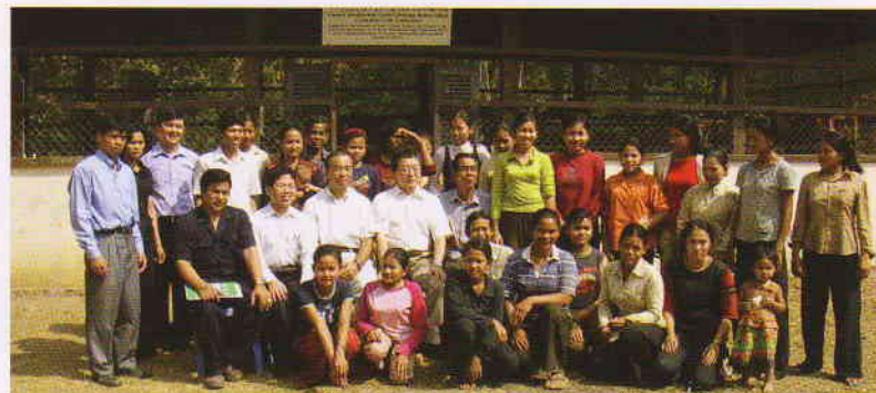
Participants and all parties involved gathered for a group photo