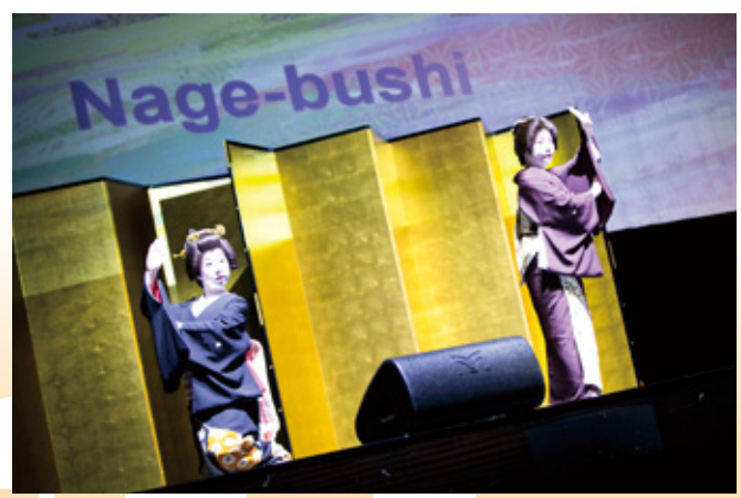
Geishas of the Hakata Kenban performing the dance item Nage-bushi

There were about 700 people in the audience that day and most of them were Singaporeans. All the feedback gathered on the geishas' performance consist of emotional praise such as "Beautiful!" or "Wonderful first experience!" An authentic geisha performance is a rare experience even for the Japanese, thus we hope that this will become a motivation for Singaporeans to discover more about Japanese traditional arts.