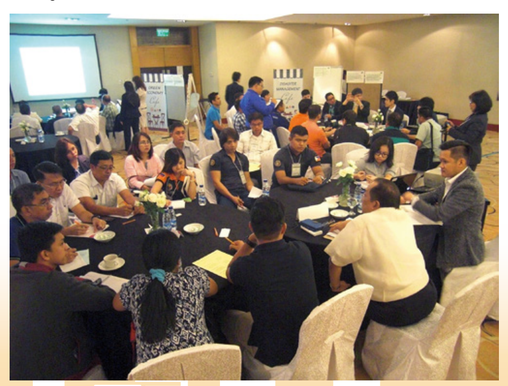
Speakers and participants exchanging their views during the Knowledge Café session

With the warm participation from all our speakers and participants, the program ended on a highly successful note and can be said to have helped contribute in further leveraging the collaboration between local governments in both the Philippines and Japan to greater heights.