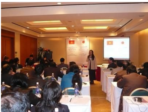
Regional Alliances Promotion Program being held in Vietnam (FY 2007)

Regional Alliances Promotion Program: A program that targets Japanese local officials and aims to introduce them to the local administration systems and recent business trends in ASEAN countries and India. It allows participants to build networks of contacts through opinion exchange sessions arranged with local administrative officials and Japanese firms that have established themselves in the respective countries.