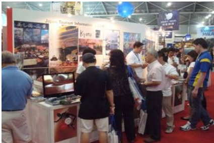
CLAIR booth at NATAS Travel 2009

5 – 7 Sept 2008 No. of visitors: around 73,000