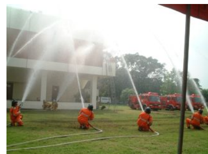
Practicing firefighting and rescue techniques in Thailand (2007)