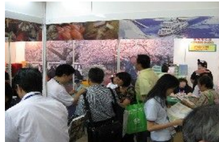
CLAIR staff attending to visitor enquiries at MATTA Travel Fair 2008