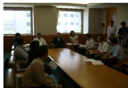
Visit to Kagoshima Prefecture (2008)

Overseas local government officials are invited to Japan to discuss and exchange information on the current situation and issues faced by local governments in both Japan and their home countries. This seminar is an opportunity for participants to gain a better understanding of the respective local administration systems and to develop networks of contacts. During the seminar, participants visit local government offices, exchange opinions and discussions with local representatives, go on field trips in the local areas and experience Japanese culture.