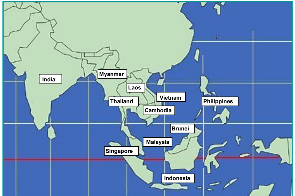
※ Not drawn to scale