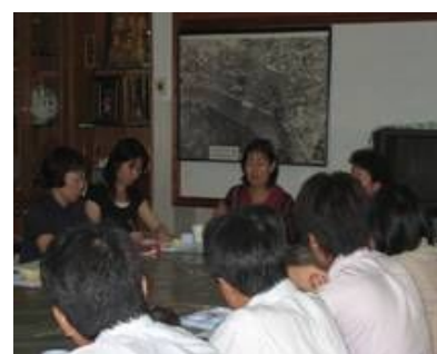
A training session at Duang Prateep Foundation

In 2008, we organized a study tour for 9 officials, consisting of 3 days of training in Japan, followed by 11 days in Thailand.