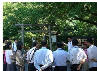
A briefing before visiting Sengan-en Garden in Kagoshima Prefecture (2008)