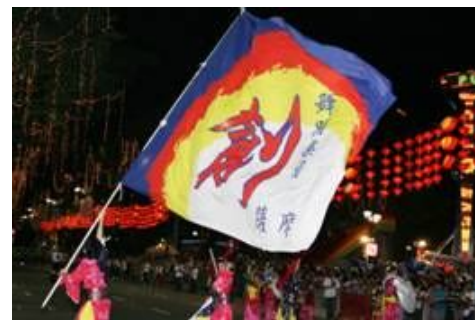
Kagoshima "So" Erg dance group participating in the Chingay Parade in February 2008.

Chingay Parade: Held annually since 1973, Chingay Parade is Singapore's largest street parade in celebration of the lunar new year.