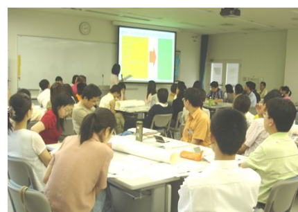
Introductory training at Japan Intercultural Academy of Municipalities (JIAM)