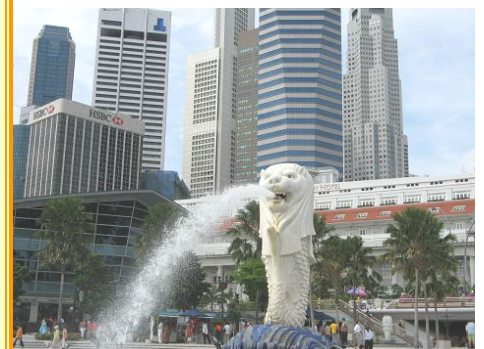
Scenery around our office