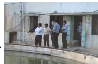
Site visit to water treatment plant in Palitana Municipal Corporation, India

Since 2000, CLAIR Singapore has been dispatching Japanese local government officials (including retirees), who have knowledge or technical skills related to international cooperation, as specialists to foreign local governments etc. in response to their requests.