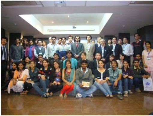
The cultural exchange session at The Japan Foundation, New Delhi