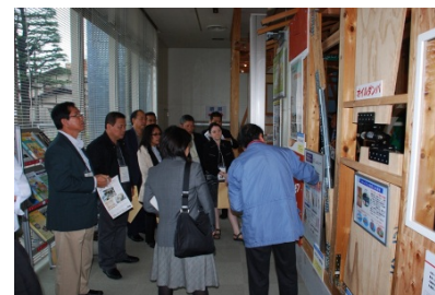
Study visit to Shizuoka Prefectural Earthquake Prevention Center(2010)