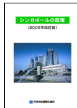
Singapore's Government Policies

http://www.clair.or.jp/j/forum/index.html (in Japanese only)