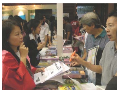
「 Thai International Travel Fair 2011 」