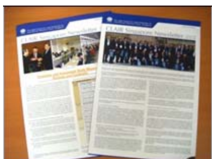
CLAIR SINGAPORE NEWSLETTER

CLAIR Singapore homepage http://www.clair.org.sg