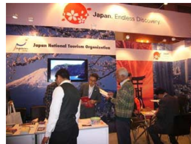
「OTM Delhi 2011」