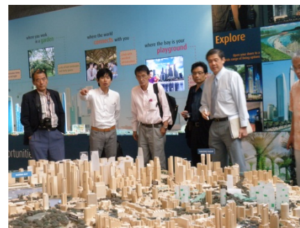
Attending to Japanese Local government officials on their field trips.

To support Japanese local government officials and local government-related personnel in their overseas events, research activities and field trips etc. in 10 ASEAN countries and India, CLAIR Singapore introduces the appropriate organizations and individuals, arranges appointments with government agencies, accompanies them on these site visits, conducts briefings on administration systems etc. and provides related materials. To date, CLAIR Singapore has assisted more than 13,000 people.