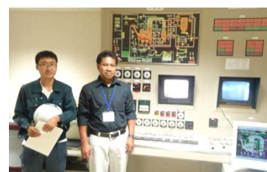
Trainee from the Philippines learning about waste management in Kochi prefecture (2010)