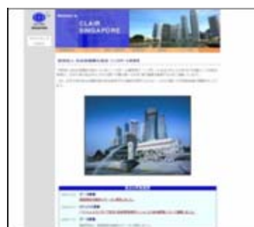
CLAIR Singapore homepage