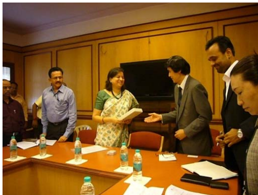
A courtesy visit to The Municipal Corporation of Greater Mumbai

A group of Japanese local government officials etc. will conduct visits to two or three cities in India, which include visits to local governments, universities, Japanese governmental organizations and firms in India. This year's program is tentatively scheduled to be implemented in November 2011 (As of April 2011).