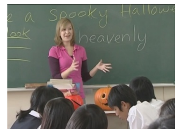
A scene of a class instructed by an ALT

The JET Program enables local authorities (prefectures, designated cities and other municipalities) to employ foreign youths for the purpose of improving foreign language education as well as promoting international exchange at the local level. By teaching foreign languages at schools nationwide and assisting with international exchange activities organized by local authorities, JET participants engage in international exchange at a variety of levels with local residents.