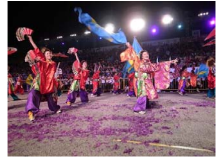
"Nippon Domannaka Festival" dance group from Aichi prefecture performing in the Chingay Parade in February 2011

CLAIR Singapore promotes international exchange between Japan and other countries through assisting in the participation of Japanese local governments etc. in cultural events such as the Chingay Parade organized by the People's Association of Singapore.