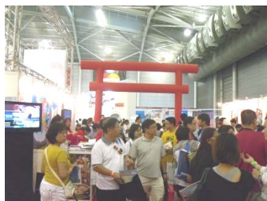
「NATAS Travel 2011」